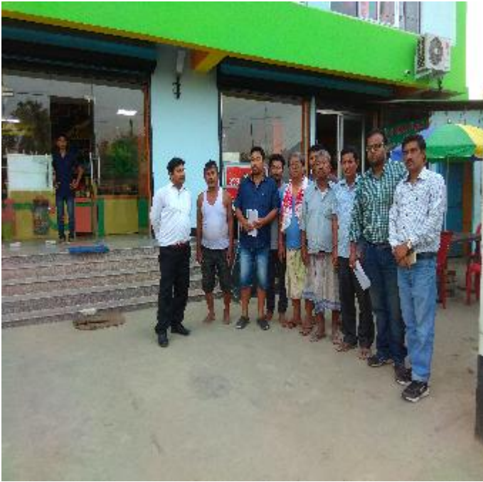
Photo 1: Public Consultation at Gauripur Dated 12-04-2018