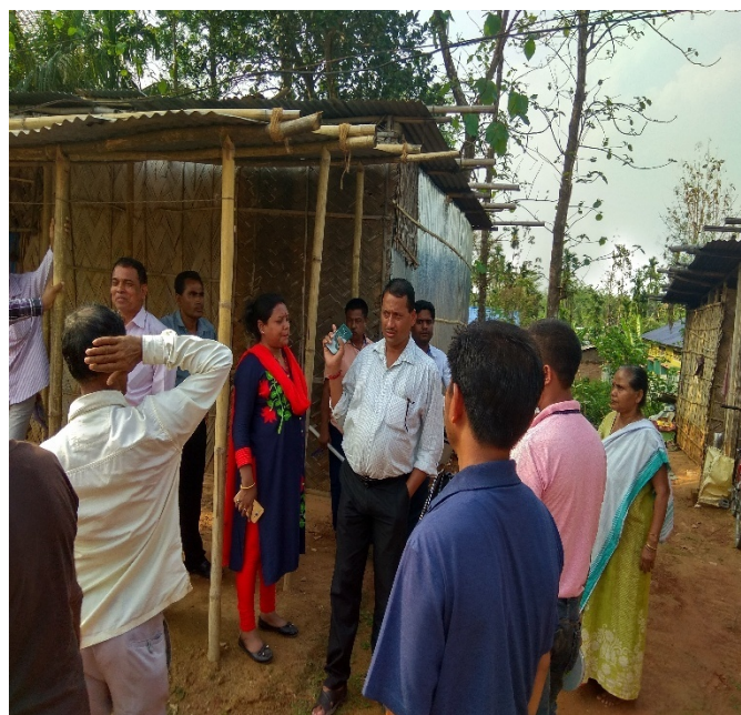
Photo 8: Socio Economic Survey at Dated 11-04-2013