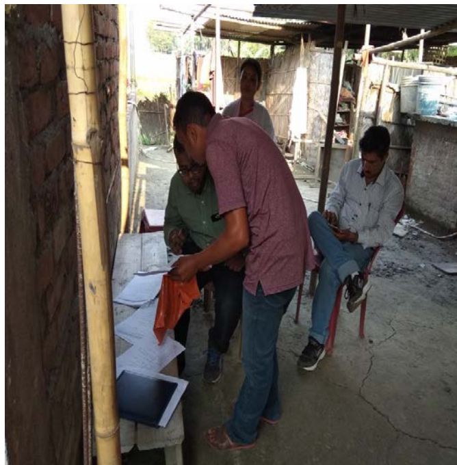
Photo 6: Socio Economic Survey at Gouripur Dated 15-04-2018