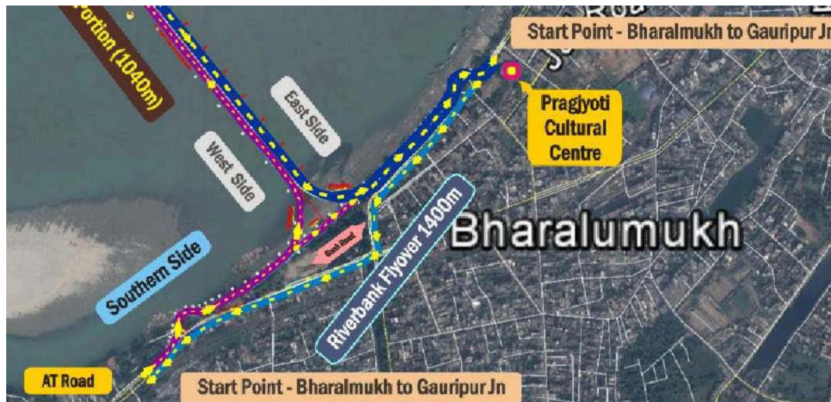
Fig-1:- Location Map