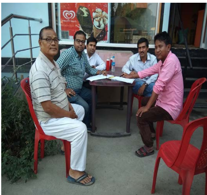
Photo 7: Socio Economic Survey at 1 No. Gauripur Ganesh General Store Dated 11-04-2018