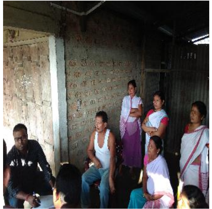
Photo 2: Public Consultation Rahadhila Dated 12-04-2018