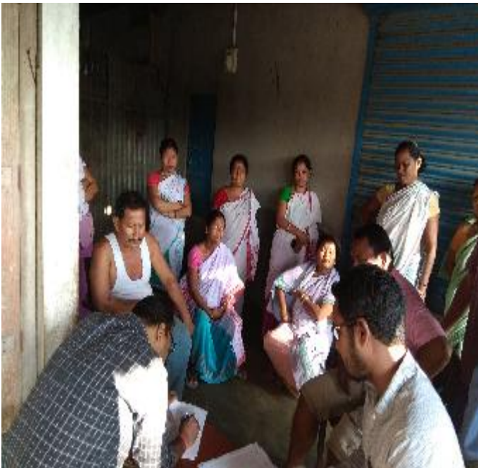
Photo 3: Socio Economic Survey Abhayapur Dated 13-04-2018