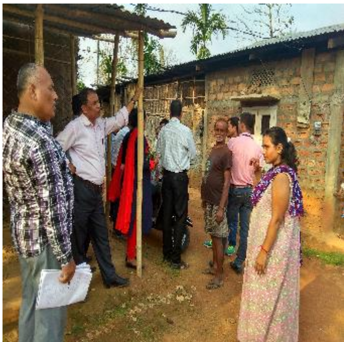
Photo 5: Public Consultation at North Guwahati Dated 16-04-2018