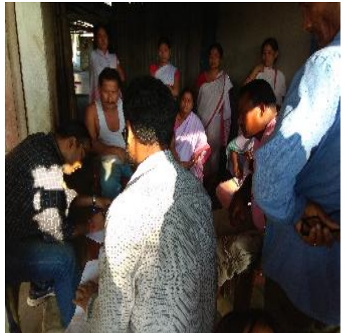
Photo 4: Socio Economic Survey Abhayapur Dated 13-04-2018