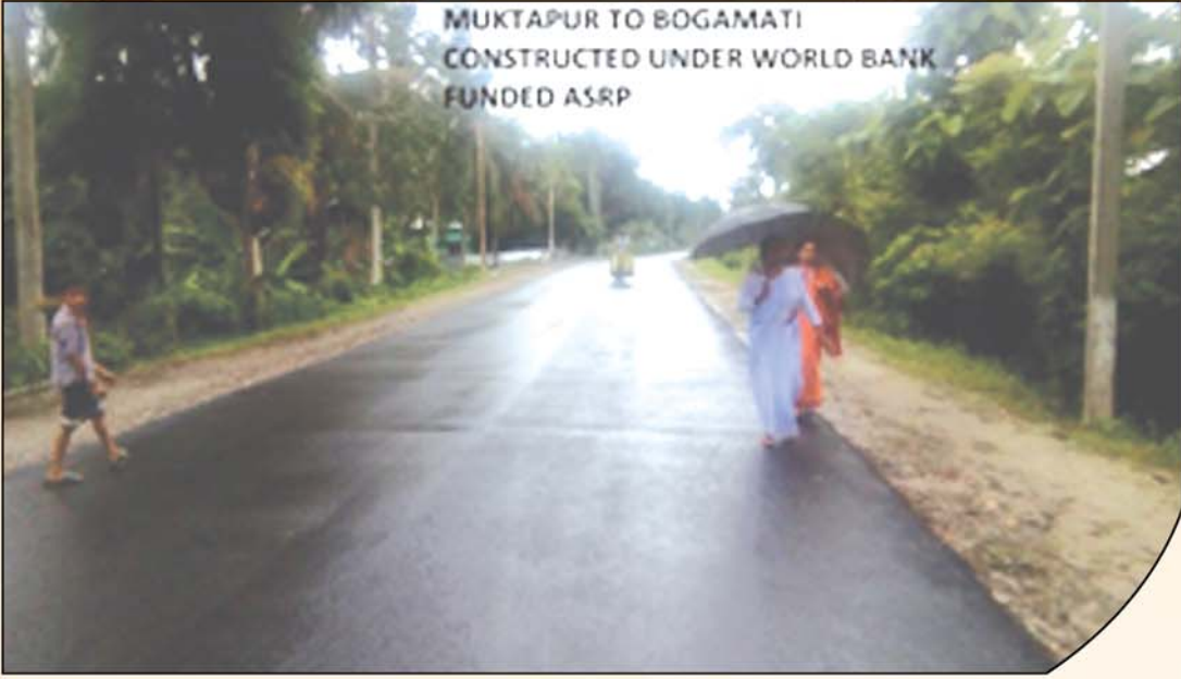
MUKTAPUR TO BOGAMATI CONSTRUCTED UNDER WORLD BANK FUNDED ASRP