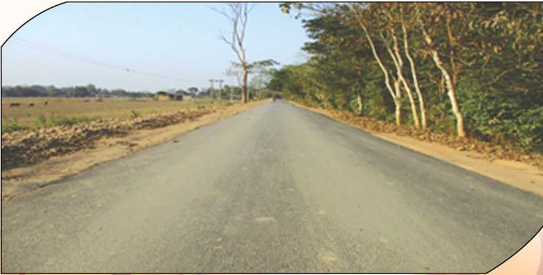
NH-37 at Kohora Chariali to Mihimukh