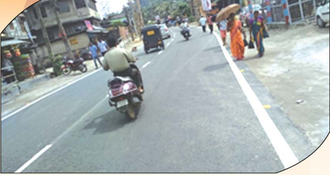
Barshapara Road at Guwahati