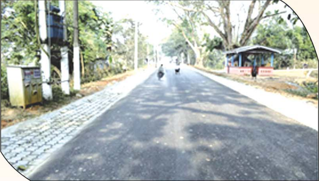
Palashbari Bijoynagar Road