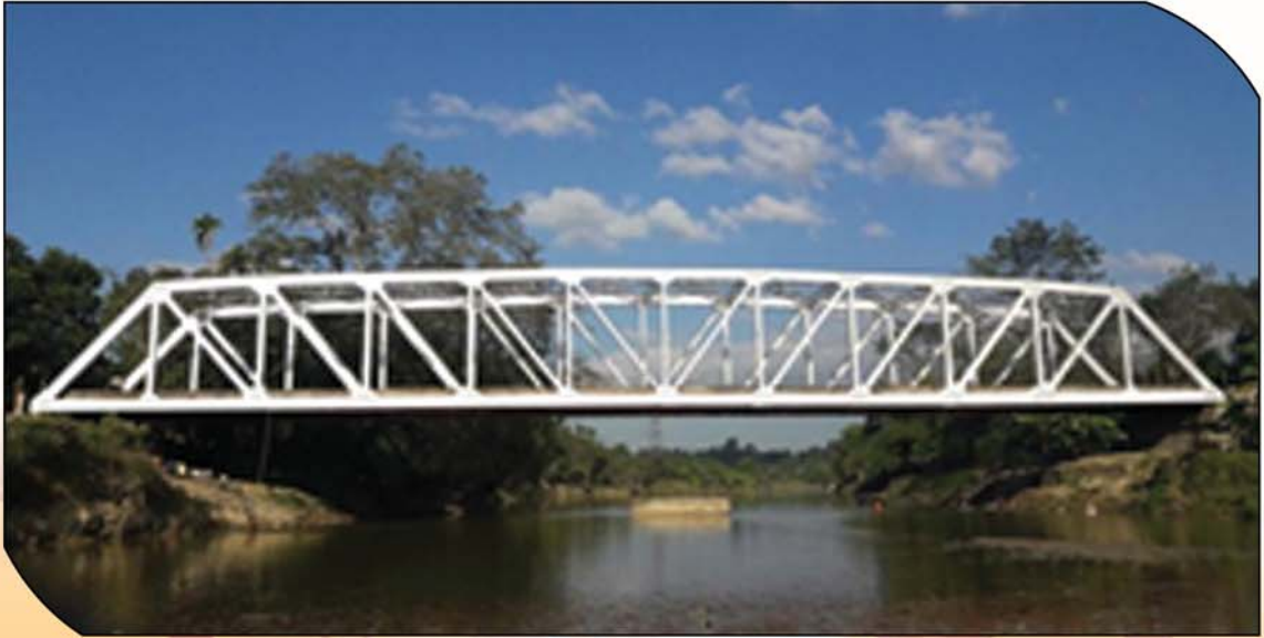
BUG Bridge at Solgoi