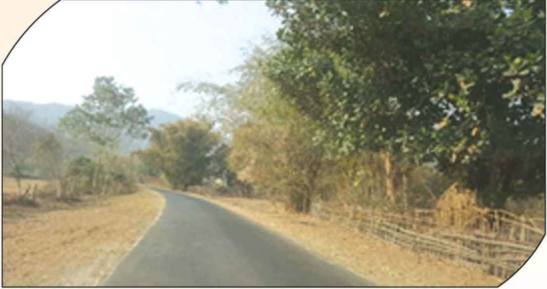
Mulagaon Chegmari Road