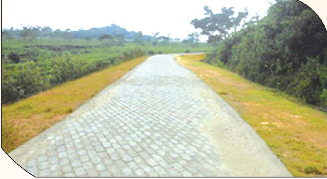
Chandkhura Kukitol NEC Road to Champabari BOP