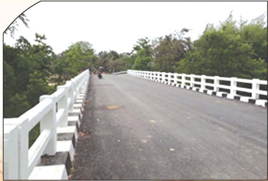
Dakhinpat Nonoi Road