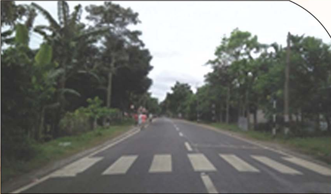
Kalitikuchi Doulasal Barpeta Road